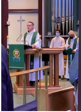
Preaching at Christ the King Lutheran Church Houston