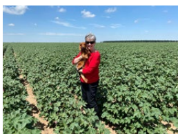
Taddi visits the farm